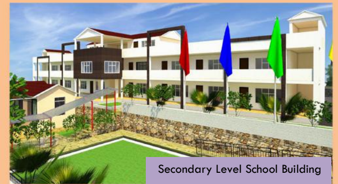
Secondary Level School Building