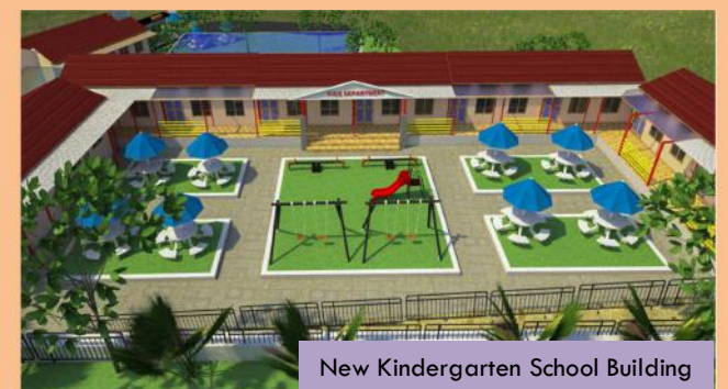
New Kindergarten School Building